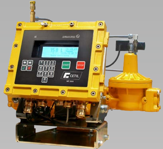
LPG meter with ME3000 electronic register