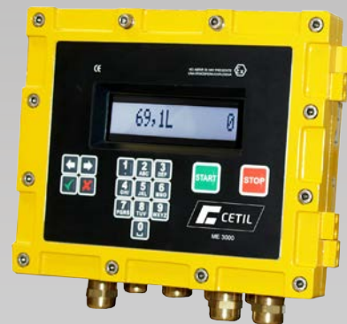
Remote slave display to show the most relevant information during deliveries (optional)