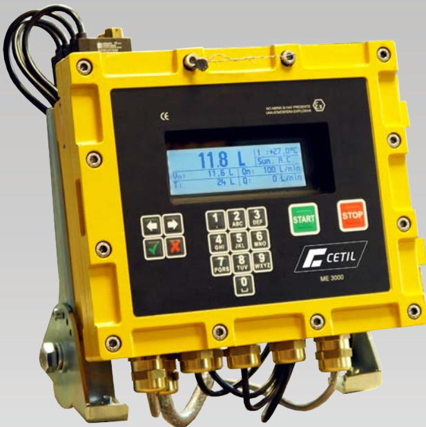
ME3000 electronic register

MID and ATEX for zones 1 and 2 Approval.